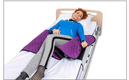
6. Straighten out the Master Turner if it was wrapped around the user.