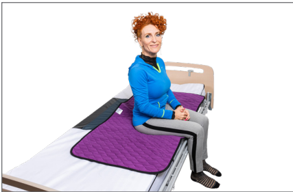
4. Place the Master Turner – S across the bed. The handles are facing towards the head end and the foot end. The user sits down on the edge of the bed on the middle of the Turner but with the pelvis well into the bed.