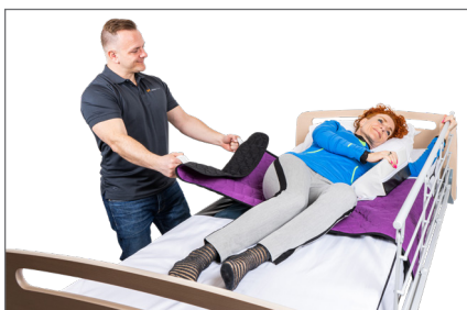
8. Turning with one helper: The user grips the bed rail and begins the turn. The helper grabs the Master Turner – S and supports the turn to side lying position. Cushions and Wedges can be used for optimal support, security, and comfort.