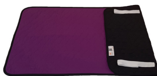
MC 001-1712 MC 001-1912