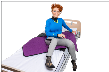
5. Master Turner can be folded around the user's pelvis. Place one hand on the bed rail and turn into the bed. The user lifts up the legs when needed.