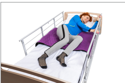
7. Independently: The user grips the bed rail and turns to side lying position using the sliding properties of the Master Turner – S under the pelvis. A Positioning Wedge – S is recommended in front of the stomach for optimal support, security, and comfort.