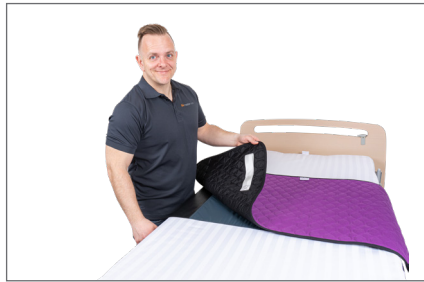
2. Place the Master Turner - S with the nylon side downwards and the purple side up.