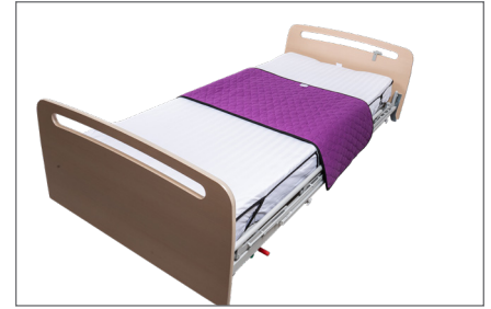
3. The Master Turner is ready to use.