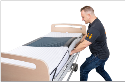
1. Mount the Mattress Cover - S on the mattress.