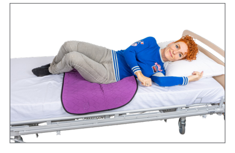
7. Carry out the turning or the adjustment of the position by pushing with the feet onto the sheet. If necessary, support the turning by using the bedrail.