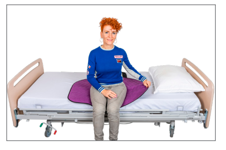
4. Sit comfortably with the Travel Master Top on the edge of the bed where the Travel Master Bottom has the anti-skid edge.