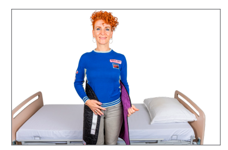
3. Alternatively place the Travel Master Top around the user with the label "This side up" towards the back.