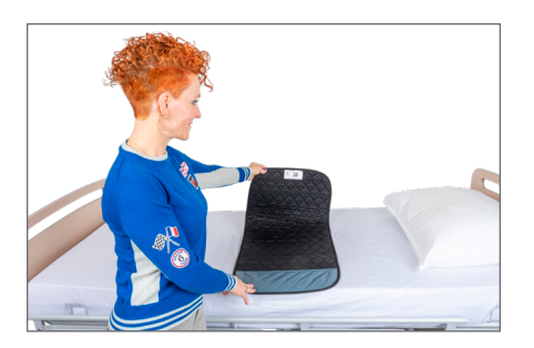
1. Travel Master Bottom should be placed in the center of the bed, with the velour facing downwards and the anti-skid edge towards the side where the user gets out of bed.