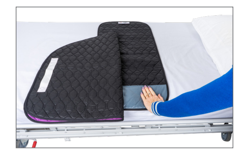
9. The anti-skid edge of Travel Master protects the user from sliding of the edge of the bed.