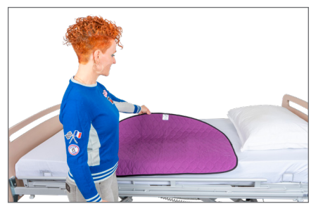
2. Travel Master Top is placed across onto of the bottom with the purple side upwards. Now it is ready for the user.