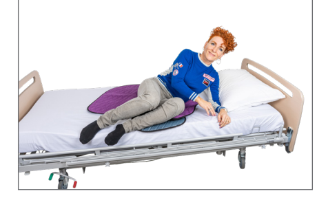
8. Getting out of bed the user can fold the Travel Master around the waist. Elevate the knee rest and the backrest if possible and turn to side lying position.