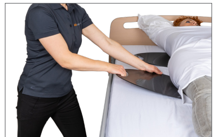
18. To remove the plates helper B pulls/stabilizes the drawsheet while helper A pulls out the Master Glide Thor from under the user.