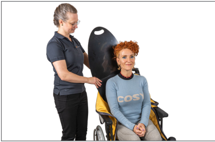
10. The two plates can easily be removed.