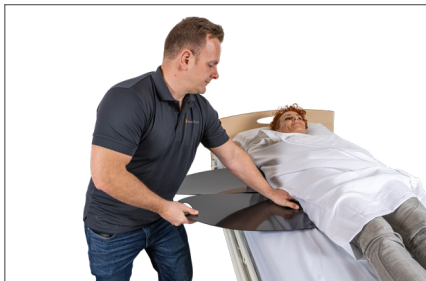
14. Place the second Master Glide Thor under the user's pelvis using the same method.