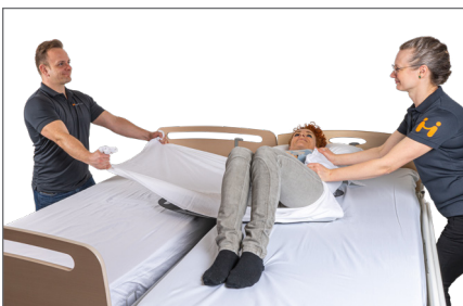
16. Helper A pushes the user slightly while helper B pulls the drawsheet. The user slides to the second bed via the Master Glide Thor.