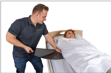
13. The user is placed on a drawsheet. Place a Master Glide Thor under the user's shoulder by pulling out the sheet and simultaneously pushing the Master Glide Thor into the mattress and sliding it under the user bit by bit.