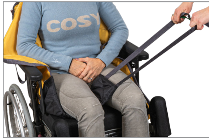
11. For positioning the leg straps of the sling sheet use the Sling Socks (MC 003-9031), hereby the user's skin is protected and there is no need for lifting the user's legs.