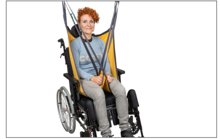
12. The sling sheet is in place and the user is ready for lifting.