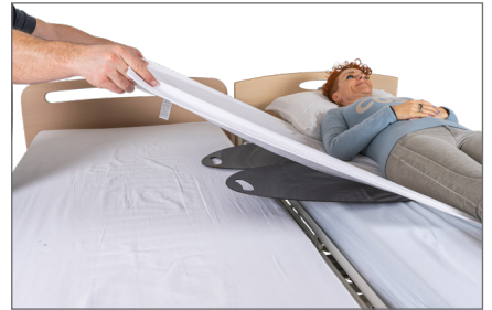
15. Place the beds close together and lock all necessary breaks. Adjust the height of the beds before the transfer, receiving bed can be a bit lower.