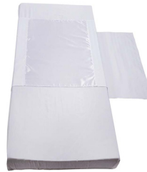
Light Cover - S