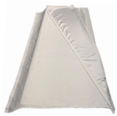
Light Turner - L