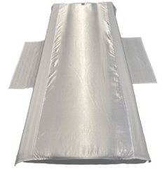
Light Cover - L