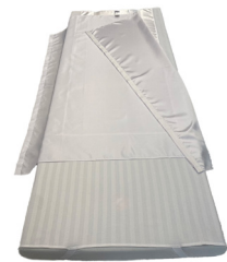
Light Turner - M