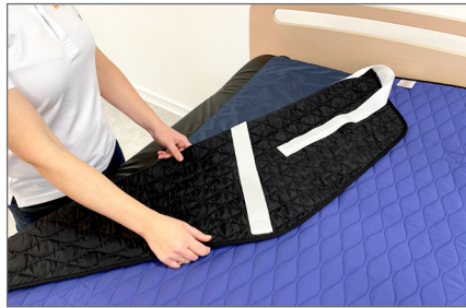
2. Place the Master Turner – L with the nylon side towards the Mattress Cover and the label "This side up" visible.