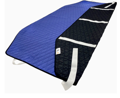
Master Turner Royal