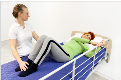
4. Bend one or both of patient's knees. The patient grabs the bed rail to participate as much as possible.