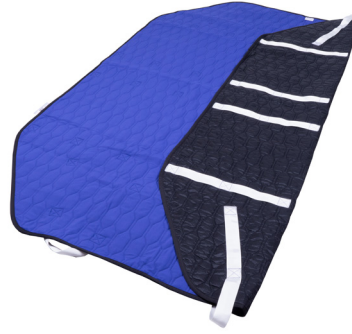
Master Turner Royal Combi