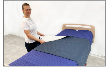
3. To protect the Master Turner and to avoid unnecessary washing an incontinence sheet e.g., MC 001-1810 can be placed on top of the Master Turner.