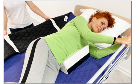
6. To increase stability and comfort in side lying, the Master Comfort Positioning Wedge - S MC 001-8035 can be placed in front of the patient's stomach before turning. Also, it increases the patient's sense of security, it keeps the stomach in place and maintains alignment of the spine in the side lying position.